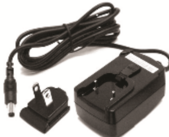
AC Adapter (2 pieces)