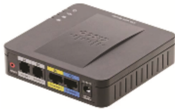
Home Phone Adapter